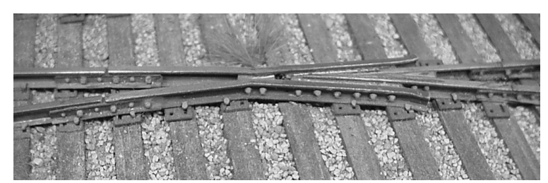
Typical Bolted Frog

NOTE: All track detail parts are Highly Detailed Nickel Silver Investment Castings in Lead-free Nickel Silver